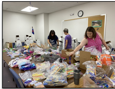
Photos from last year's packing party.